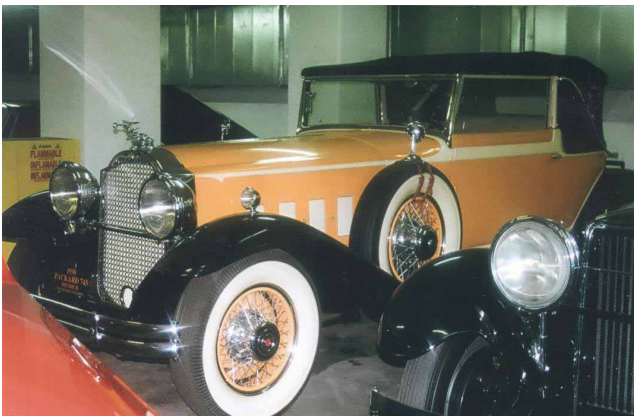
A 30 Packard 745 conv. Dietrich in Petersen Museum