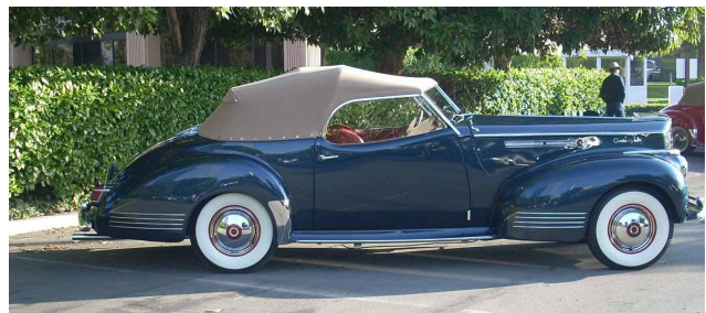
One of the many Darrins at the Meet