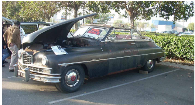
Not all cars were show cars, some needed help and were for sale.