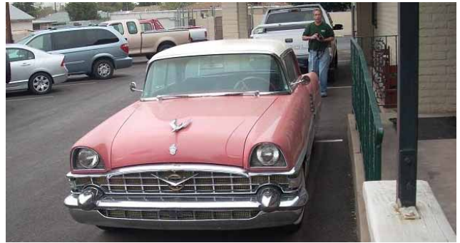
Kerry Warrick's 56 400.