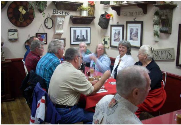
The Restaraunt was 'cozy'.