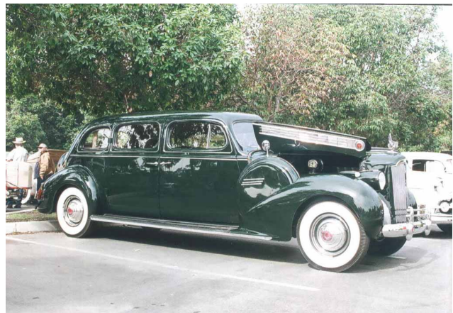
1941 180 Limo.