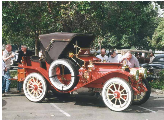
1910 Packard, oldest Packard there.