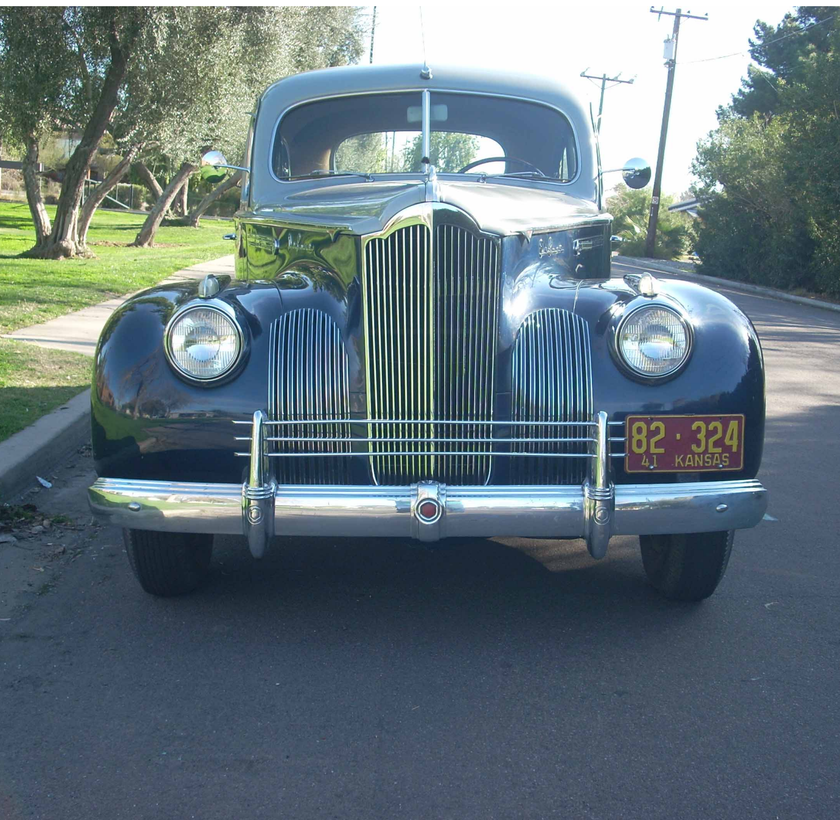
Art Butler's 1941 110 Sedan