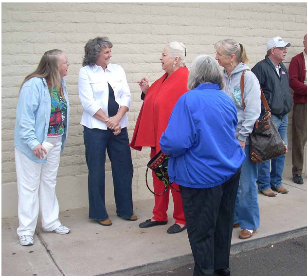
This is one event even the Ladies came out for.