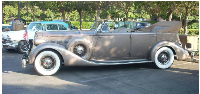
There were lots of nice Packards there and above are only 2 of them.