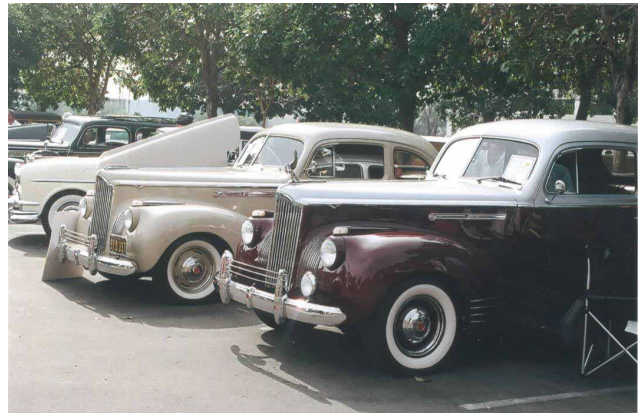
A couple of nice 41 Coupes