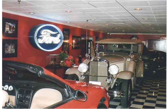
One picture of Sanderson Ford Museum cannot do it justice. The next time we get to visit this private museum, you need to come see it for yourself.