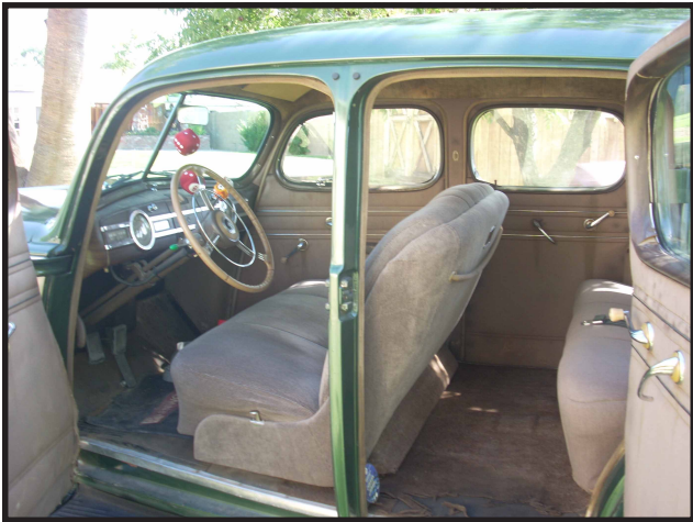
Looks very roomy inside