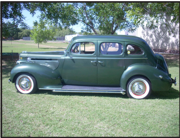
Great side view of a jr Packard.