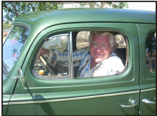
Definitely 'Ask the Man Who Owns One' why they are smiling while driving their car and they'll be happy to tell you.